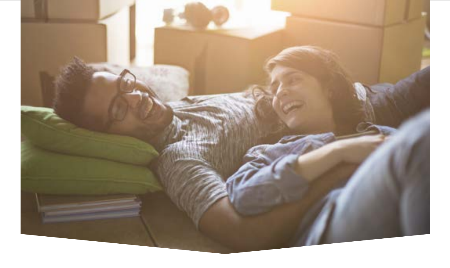
Pack a "first day" box with items you will need right away.